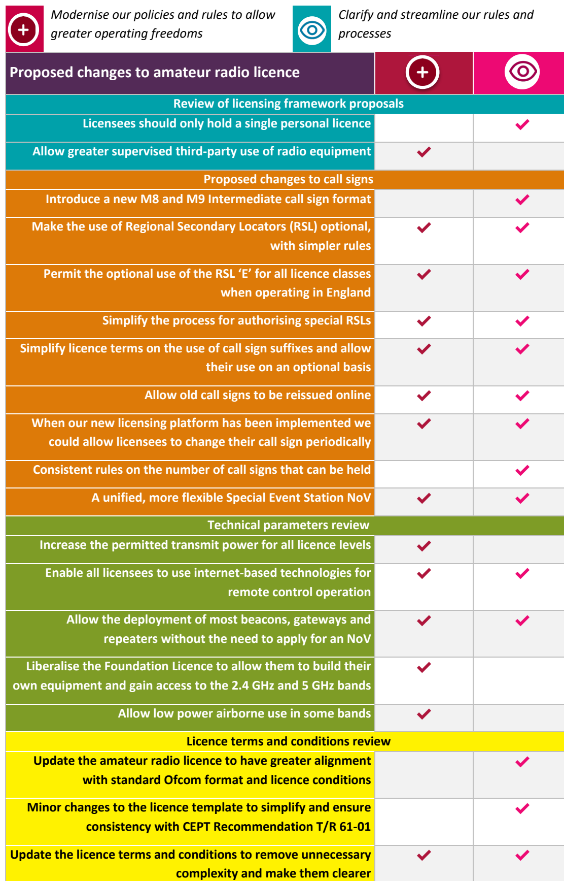
Figure 1: Key elements of the proposed amateur radio licensing framework changes